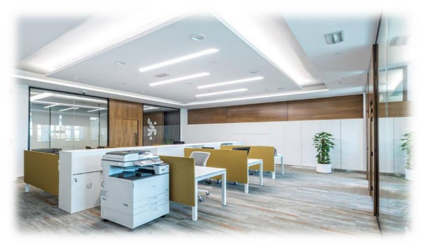
TECOM DMC Office