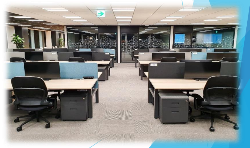
SERVICE NOW OFFICE