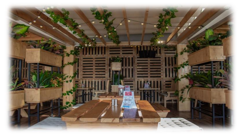
THE SCENE RESTAURANT